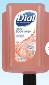
Hair & Body Wash